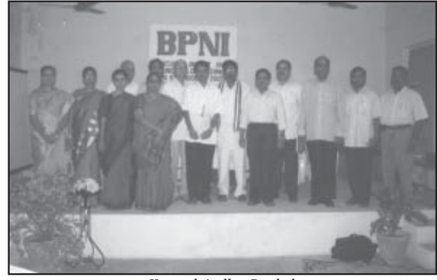
Kurnool, Andhra Pradesh