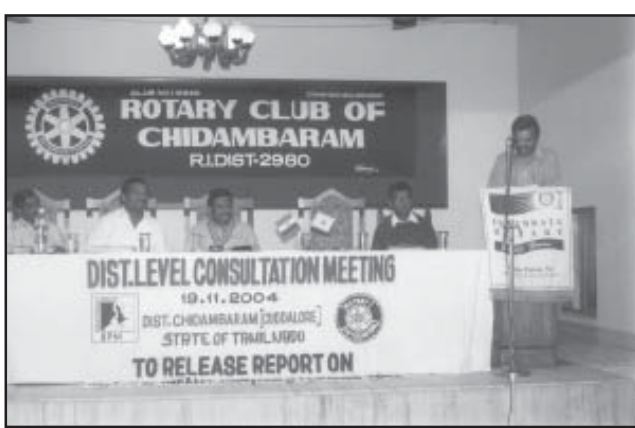
Chidambaram, Tamil Nadu