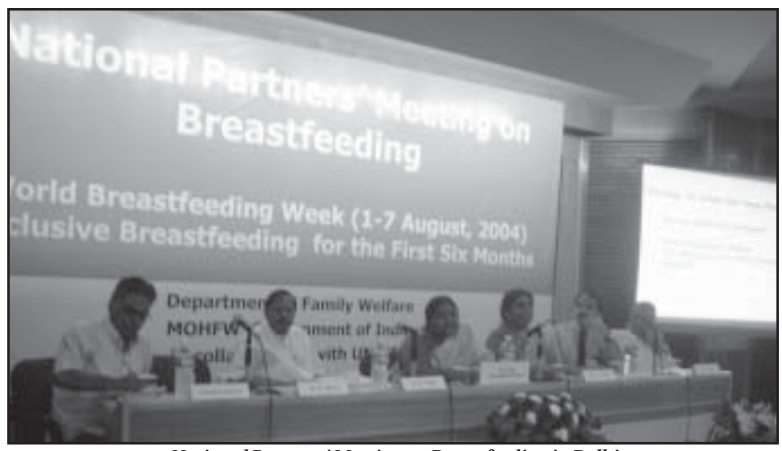
National Partners' Meeting on Breastfeeding in Delhi

BPNI released its National Report on "Status of Infant and Young Child Feeding in 49 Districts (98 Blocks) of India 2003" at Hotel Claridges, New Delhi on 1st September. This report based on interviews of about 9000 mothers, reveals a very low rate of starting breastfeeding within one hour and exclusive breastfeeding for the first six months. This study was conducted from two blocks each of 49 districts across 25 states and 3 UTs of India. The report emphasizes that promotion of optimal infant and young child feeding practice, including exclusive breastfeeding for the first six months, continued breastfeeding for two years or beyond along with appropriate and adequate complementary feeding starting after six months, is crucial for the prevention of malnutrition. The report was released by Shri Jairam Ramesh, Member of Parliament and member of the National Advisory Council. He pointed out that malnutrition was high not only in poorer states but also in certain pockets of progressive states. He also said that if we continue in the present way, it will take 40 years to effectively reduce child malnutrition. Thus Infant and Young Child Feeding provides a great window of opportunity towards lowering Infant and Young Child malnutrition. Smt. Reva Nayyar, Secretary Department of Women and Child Development (DWCD), Ms. Erma Manoncourt, Dy Director,