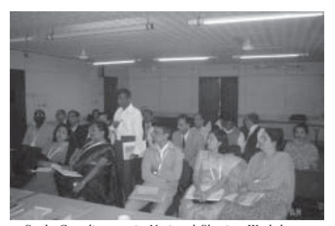
Study Coordinators in National Sharing Workshop at Delhi