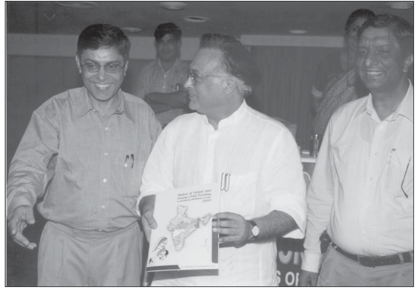
Release of a National Report on "Status of Infant and Young Child Feeding in 49 Districts (98 Blocks) of India 2003."

Programs, UNICEF India, WHO, various NGOs and professional bodies participated in the report release function.