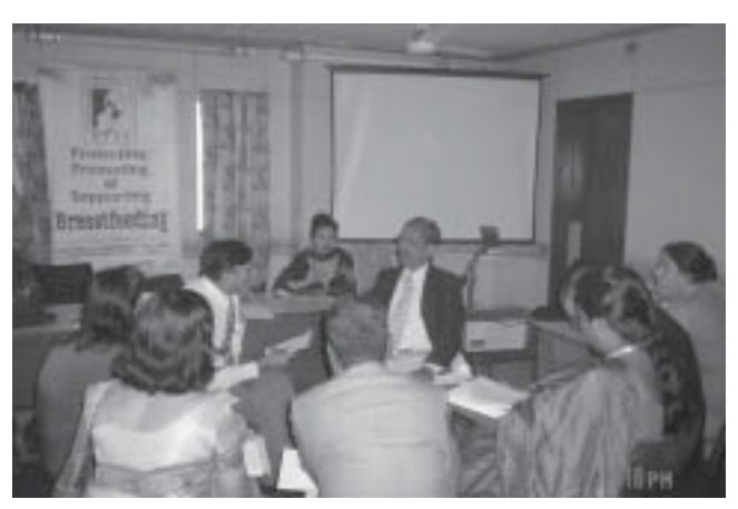
Group Discussion in National Sharing Workshop at Delhi

To address the issue on Infant and Young Child Feeding, BPNI implemented a 3 year project "Protection of Breastfeeding in India" supported by the Government of Luxembourg and UNICEF NATCOM Luxembourg. A sharing meeting of the constraints and experience of the study was conducted on 3-4 December 2004 at Delhi. The aim of the project was to kick start action on IYCF at District level and BPNI organised a three-day capacity building workshop for the district coordinators on 5-7 July 2002. These district level persons were to conduct study on IYCF in their district. It is believed that such an exercise would initiate a process that would arise from the grass root level according to the needs of the community and will generate more action. Any intervention thereafter would be more prudent and effective to improve infant feeding practices at district level. The