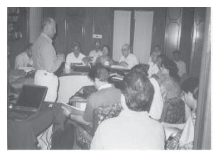
Training \, in \, Jaipur

As a follow up of this trainers course, in Gaya (Bihar) a training course conducted from 10-16 December 2004. 24 trainers of frontline workers of RCH-ICDS who are existing instructors and trainers of ANMs/AWW centres were trained for seven day by 7 Bihar State trainers under supervision of BPNI Course Directors.