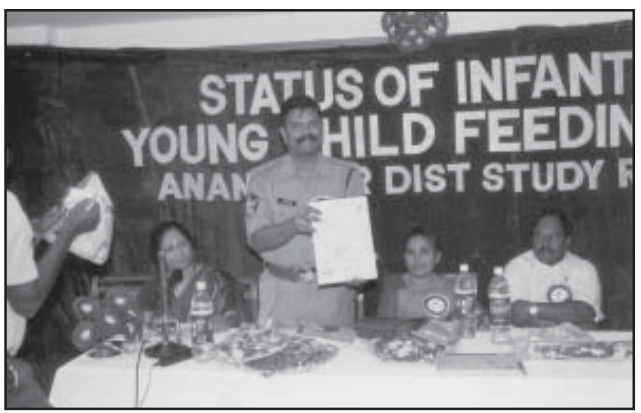
Anantpur, Andhra Pradesh