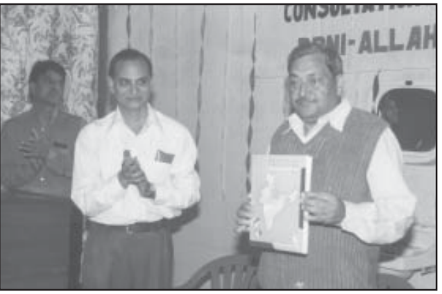
Allahabad, Uttar Pradesh