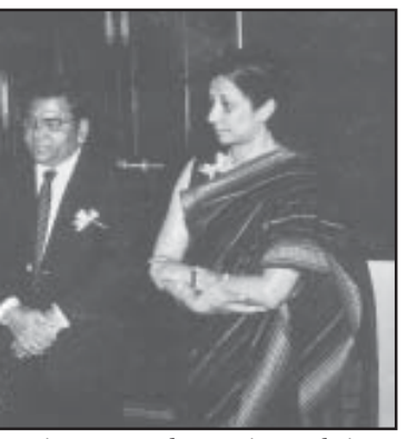
PNI inaugurates the WBW in Mumbai, rashtra