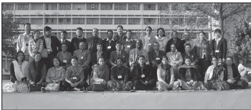
Participants at the 1st International Training Course

The course was organized with the objective of building national capacity to address the skill building of all health care workers for counselling on IYCF. The course helped in creating 'national teams' of trainers for action at local level in different countries and also in other states of India.