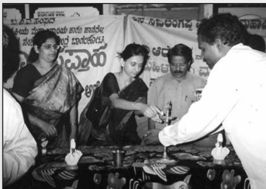
BPNI Bangalore District Branch