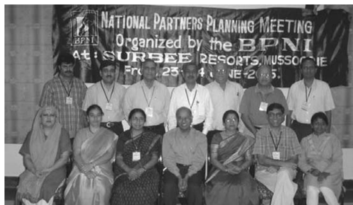
Participants at "National Partners Planning Meeting"