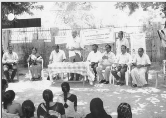
Seminar on Breastfeeding & Family Foods