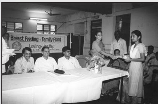
Prize Distribution Ceremony, BPNI-Adoni, Kurnool