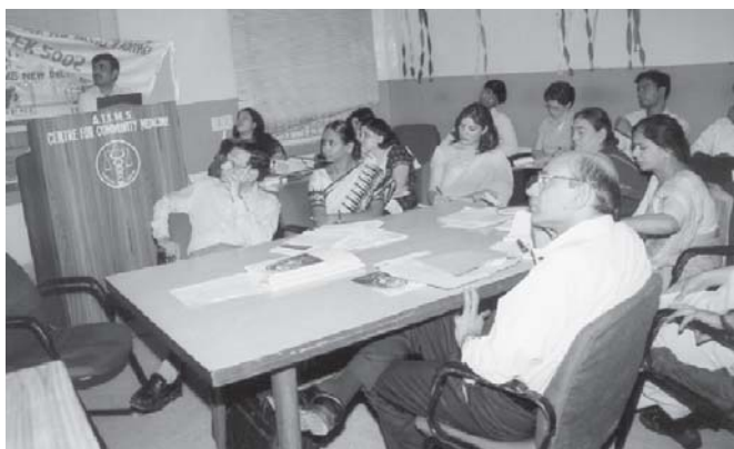
Group photo of National Workshop on Rapid Assessment

Rapid Assessment of the Status of Global Strategy for Infant and Young Child Feeding (IYCF) practices at the