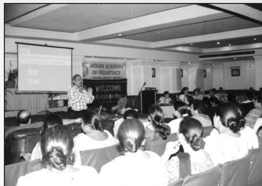
BPNI Ludhiana District Branch