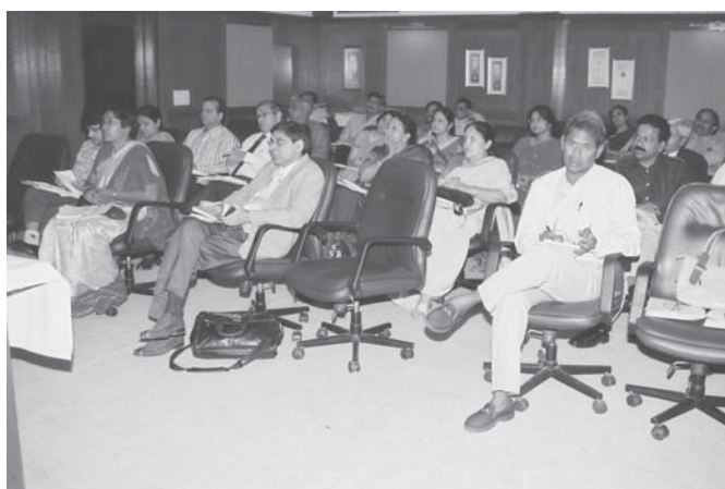
Workshop of Regional Education in progress

Regional Education Leaders, for incorporating IYCF in the undergraduate curriculum of medical students, were invited to the Workshop on Sensitization of Nodal Senior Faculty Members from the departments of