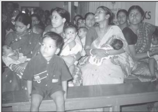
BPNI Nadia District Branch