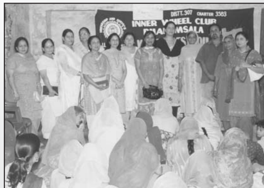
Inner Wheel Club, Dharamsala