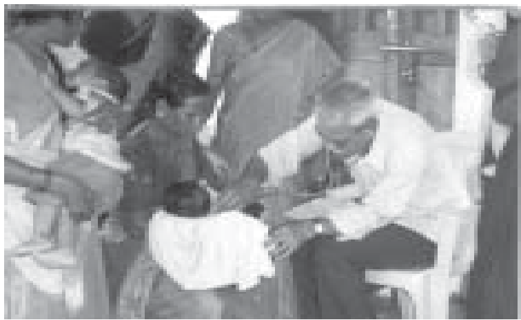
State level activities