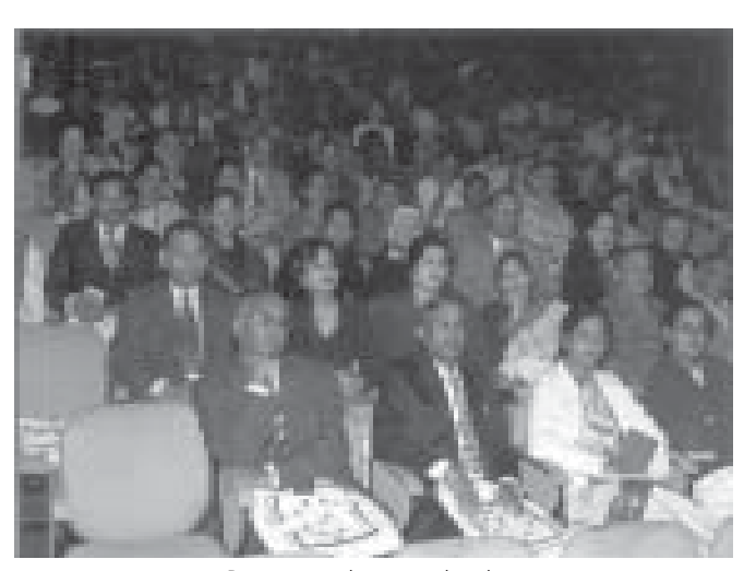
Participants listening the chair