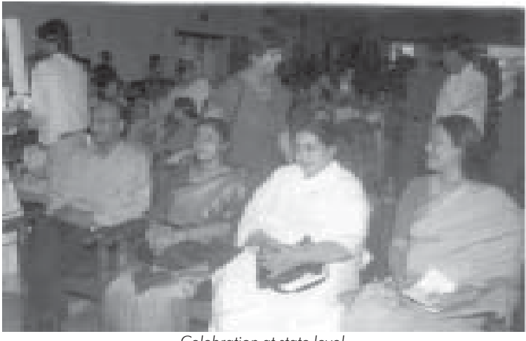
Celebration at state level