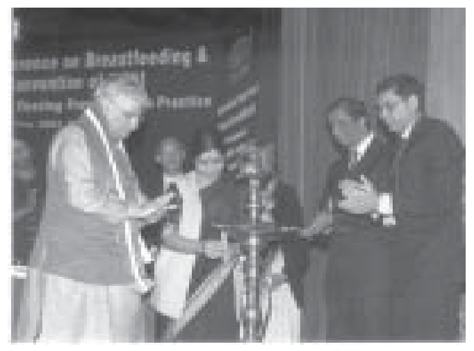
Lighting the lamp by Hon'ble Minister Smt. Sushma Swaraj

Smt. Sushma Swaraj spoke of the need to keep gender issues at the centre of any policy and programme planning to centrestage breastfeeding. She said, "It is equally important to focus on womens