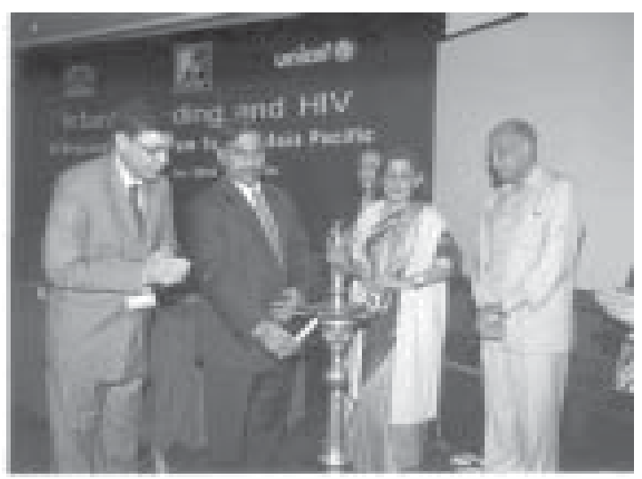
Lighting the lamp by Minister of State, MOHFW, GOI, Sh. A. Raja

The day proceeded with three plenary sessions followed by group discussions. The first plenary session was on Infant feeding and HIV: Global Perspectives. The second plenary was on Prevention of Parent to Child Transmission programme and Infant Feeding – Country Perspectives and the third plenary was about Infant Feeding and HIV: