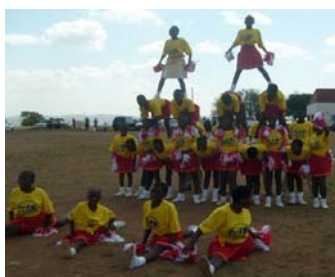
Figure 2: Displays by School children in Swaziland

v) World Breastfeeding Week Celebrations - IBFAN Africa annually disseminates both soft versions as well as hard copies of the WBW Action folders upon receipt of the same from WABA. Whereas in previous years, WABA used to provide a separate budget for this activity, no funds were received for 2011. However, the Regional Office dispatched the folders with the theme: “Talk to me! Breastfeeding—a 3D experience” to all network members. Most countries launched their celebrations during the first week of August and continued raising awareness on breastfeeding and infant and young feeding for the rest of the month or till the end of October as was the case in Cameroon. The occasion was marked in different countries by a variety of activities such as presentations to health workers, dance and music events involving local celebrities, puppet shows, role plays by youth groups for the public, interactive dialogue with Village Support Groups for mothers and national radio and television talk shows. These celebrations have become a rallying point which brings together health workers, the public, community groups, religious leaders, women’s federations, Baby Friendly Community Initiative (BFCl) villages the UN family and politicians. Due to a lack of funds, the Regional Office could not travel to other countries for the promotion of the commemorations; however it was able to participate in the local celebrations in Swaziland.