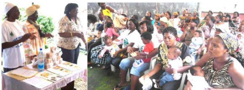
Figure 1: WBW Cameroon – Talk to mothers