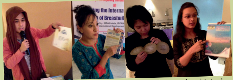
Analysing company materials - this is not acceptable ... this label is no good ... this is bad ... ... but this is ok.