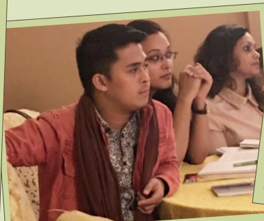
Listening intently to the judge.