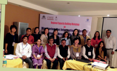
Day 1: good progress & all smiles.