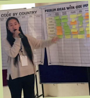
The problem with China ... from NGO point of view.