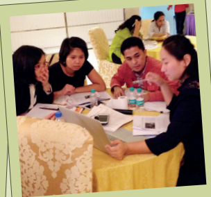
Participants in a mixed country group learn from one another.