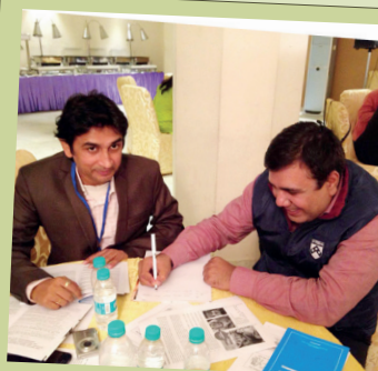
Government officials from India look at social media promotion.