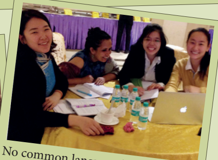
No common language but there is common understanding on the Code.