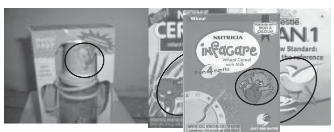
Pictures of infants or mothers or graphics on the label of infant foods or feeding bottles