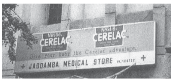
Promotion to public