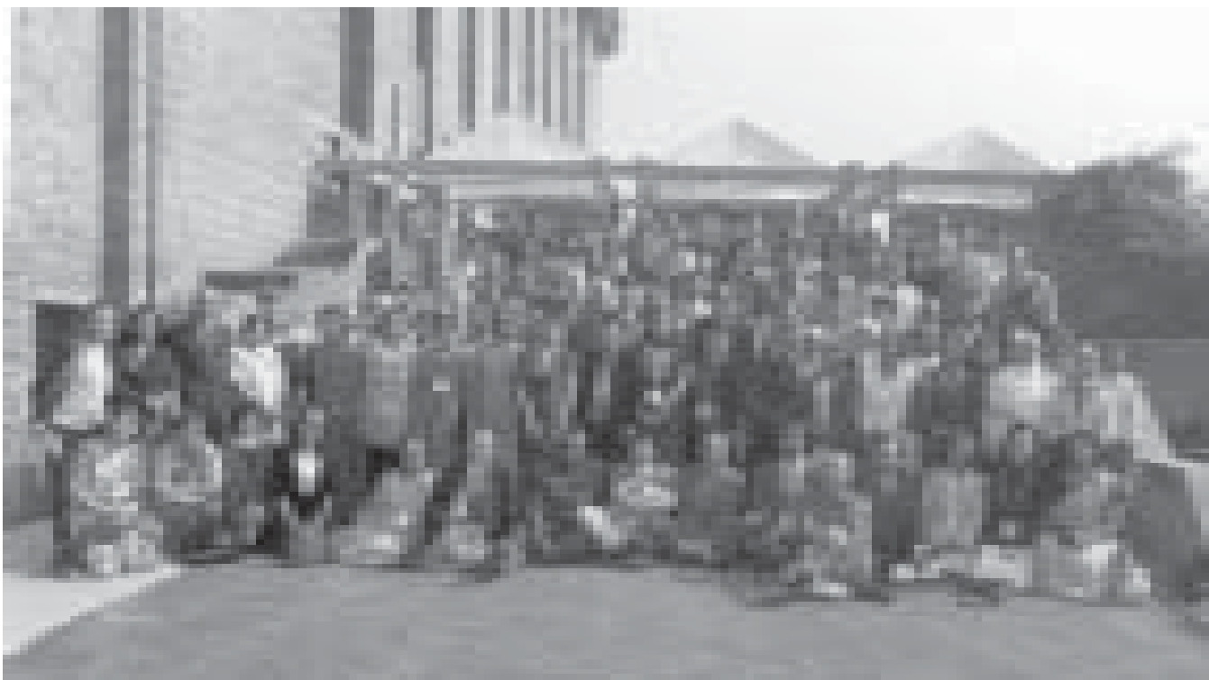
Participants at the colloquium