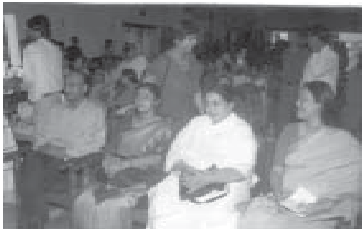
Celebration at state level