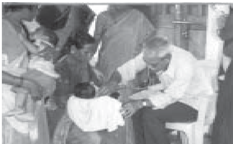
State level activities