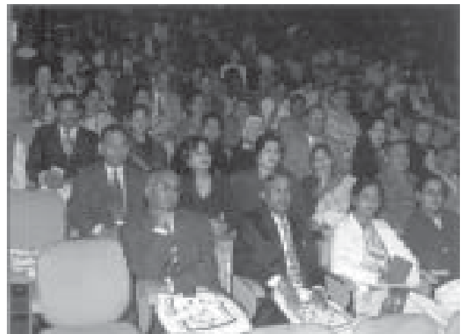
Participants listening the chair