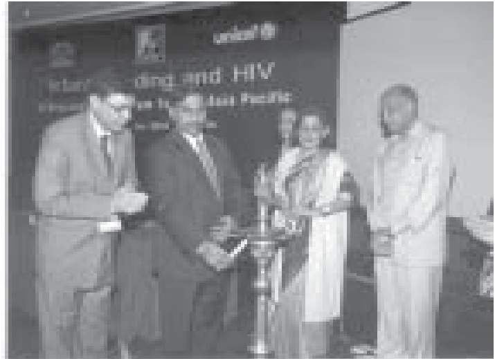
Lighting the lamp by Minister of State, MOHFW, GOI, Sh. A. Raja