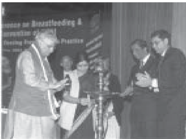
Lighting the lamp by Hon'ble Minister Smt. Sushma Swaraj

Universal Exclusive Breastfeeding during first six months can prevent 22% of diarrhoea death