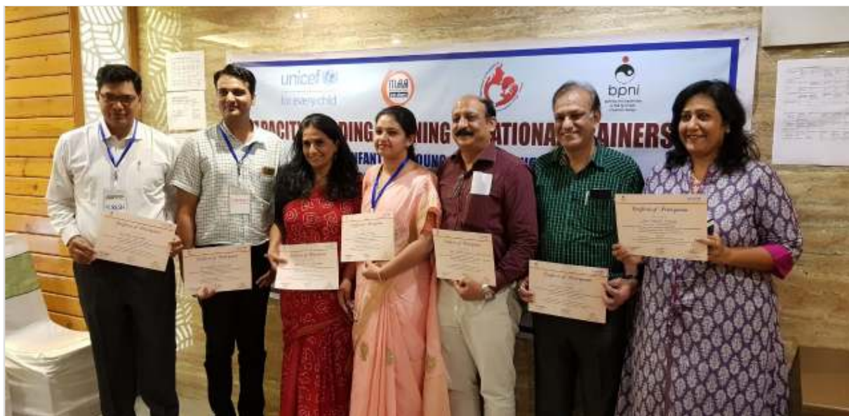
6 NATIONAL TRAINERS WITH THEIR CERTIFICATE OF PARTICIPATION AT THE LAST DAY OF TRAINING