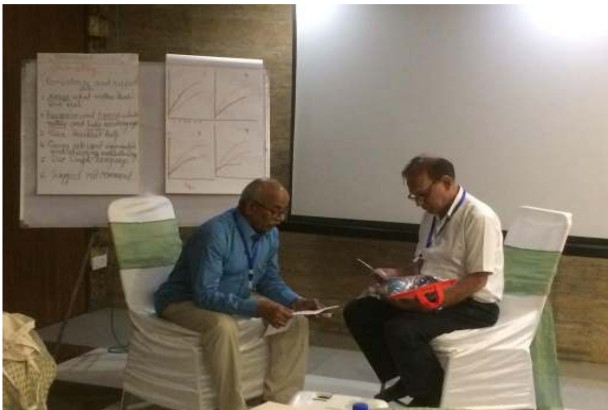
Learning through Role Play

Counselling Session were conducted among the participants to enhance the Counselling Skills and later with the children and their mothers in Umaid Hospital and MDM hospital.