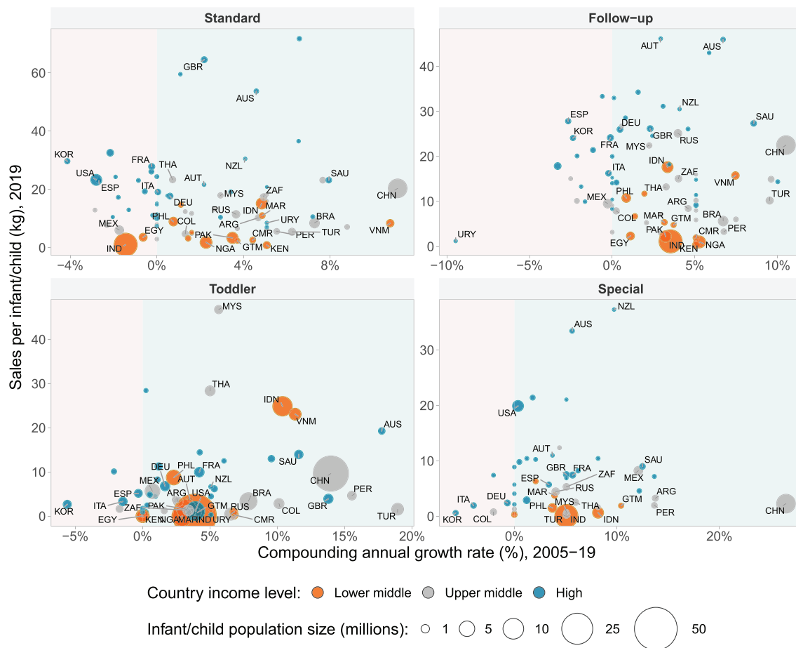
FIGURE 3 Country milk formula category sales volumes (kg) per child in 2019 v. 14-year compounding annual growth rate (CAGR; %) for 2005–2019; weighted markers represent infant/child population sizes

Growth was also strong in LMICs at 122.3% over the same period, although with some exceptions (e.g. Indonesia) total per child volumes were 3- to 4-fold lower than in UMICs and HICs respectively.